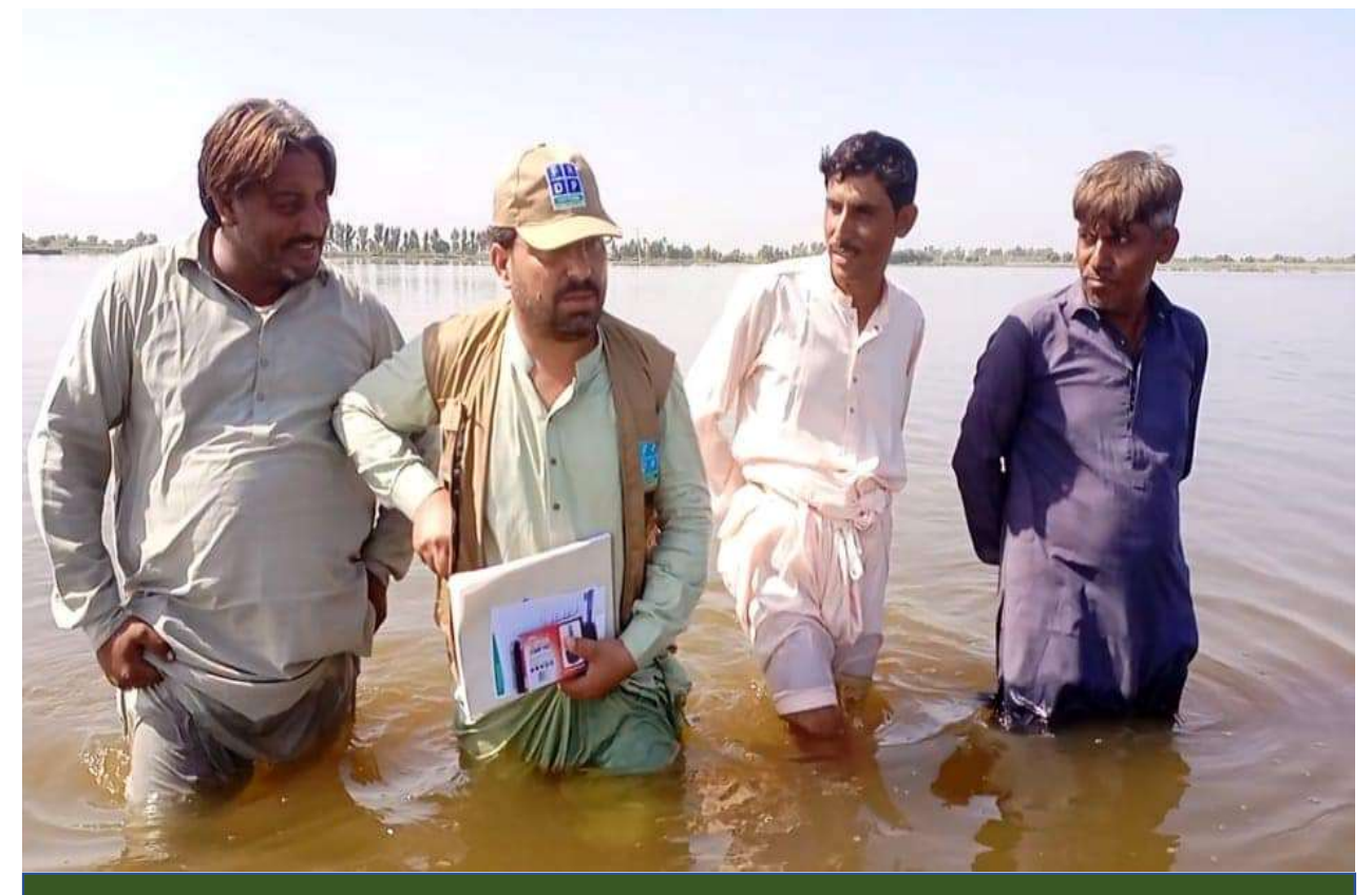
Flood 2020 - The FRDP team visits flood-affected people to assess their food needs